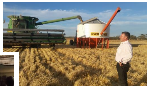
James admiring the harvest – some yields up to 30 bags to the acre (old terminology)